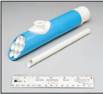
Cutaway of Tubing Shows Wide-Channel Tubular Membranes.