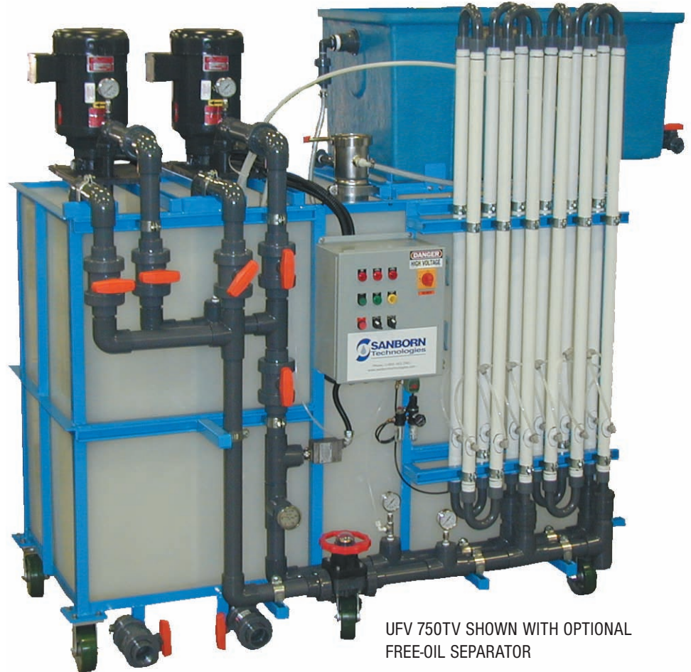
UFV 750TV SHOWN WITH OPTIONAL FREE-OIL SEPARATOR

Models are shipped pre-wired and pre-piped for easy installation. Options include an integrated free-oil separator, automatic fluid transfer system, flushing shutdown system and packaged water reuse designs.