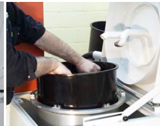
4. The filled sludge basket is removed with solids