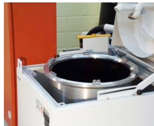
5. A cleaned sludge basket is reinstalled.