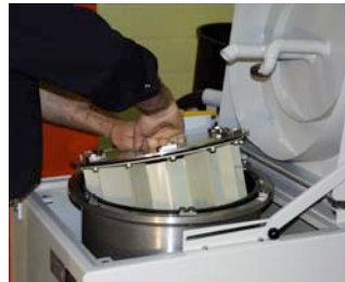
3. The Rotor cover is removed