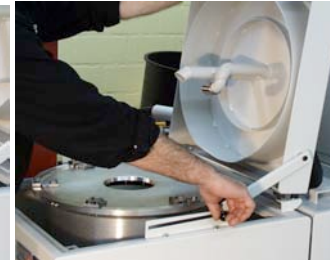
6. The rotor cover is reinstalled and locked in place, housing cover lowered, and centrifuge switched on.