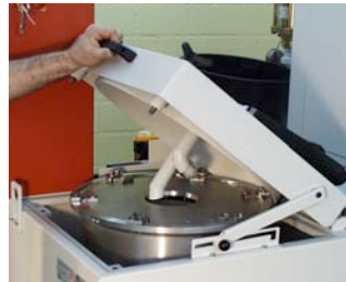
1. The Centrifuge is switched off; the hinged cover is opened

The separated sludge can be quickly and easily removed from the T22 rotor.