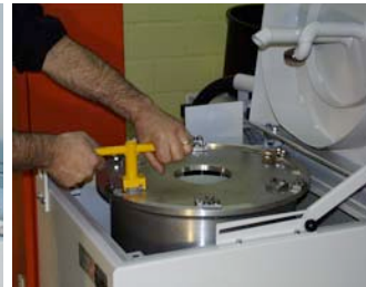
2. Rotor cover Locks are disengaged