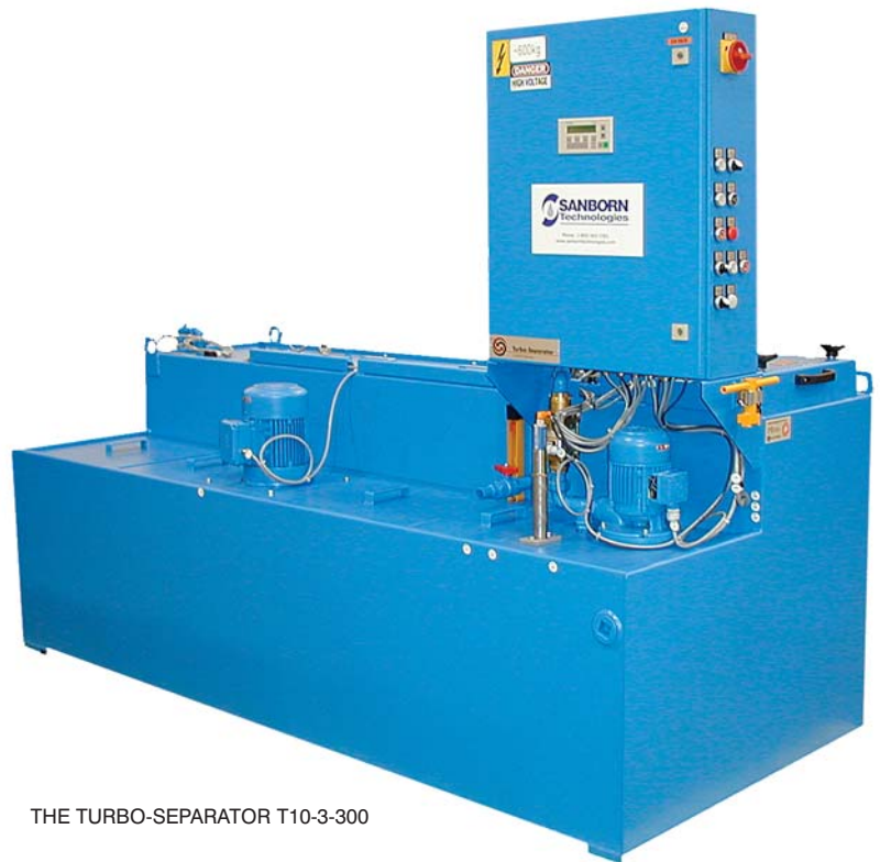
THE TURBO-SEPARATOR T10-3-300

The T10-3-315 is a value priced coolant recycling system that will reduce coolant waste.