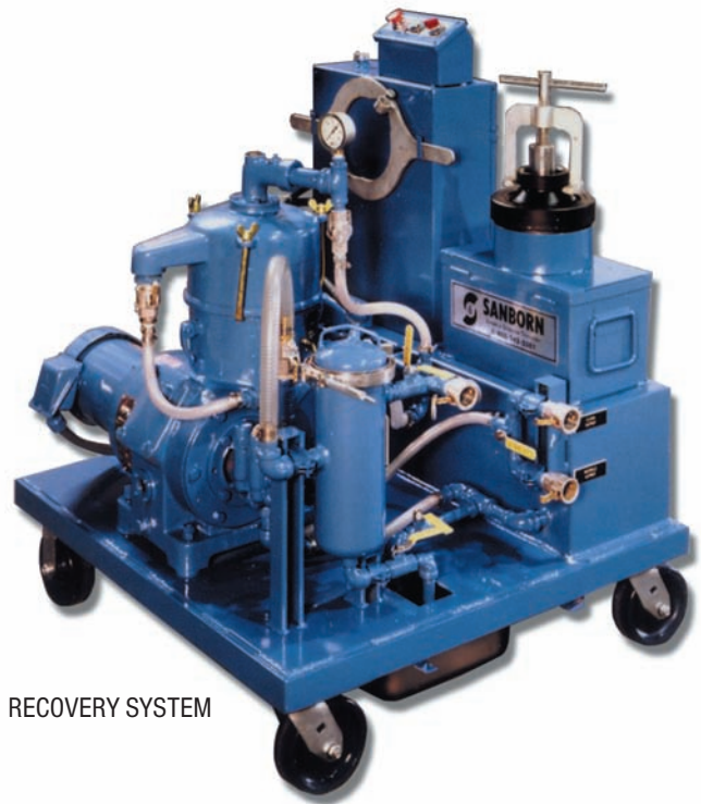
PURITAN RECOVERY SYSTEM

The Puritan is backed by Sanborn Technologies' Process Guarantee.